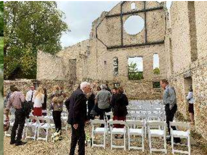
Trappist Monastery Ruins